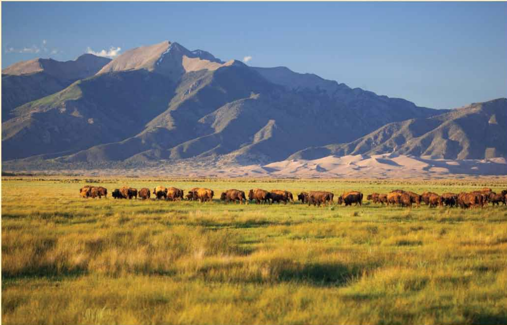
Blown below the Sangre de Cristo Mountains—Medano-Zapata Ranch, Alamosa County. National Register of Historic Places—Los Caminos Antiguos Scenic & Historic Byway