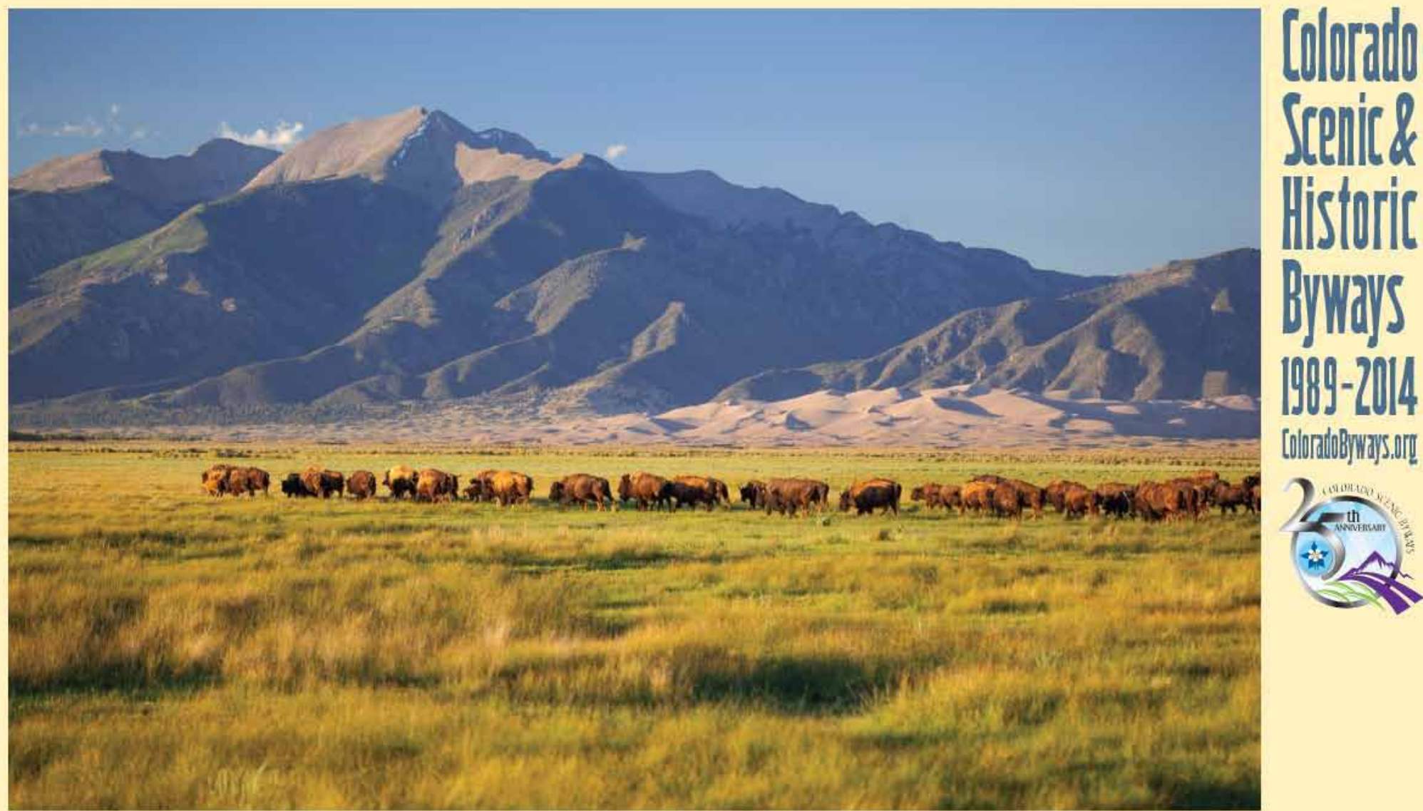
Biom below the Sangre de Cristo Mountain -- Medano-Zapato Ranch, Alamana County. National Register of Historic Flaces-Les Camines Antiguos Scenic & Historic Symp