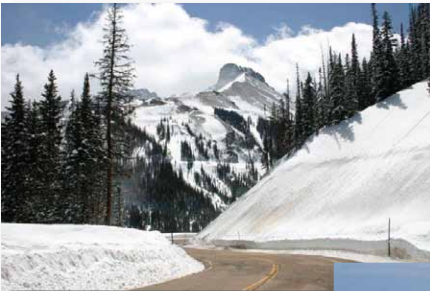
2nd Place - Chris Platz Cache la Poudre North Park