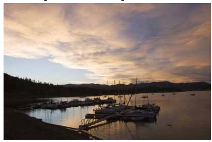
Rocky Mountain National Park Arapaho National Recreation Area Colorado River Headwaters