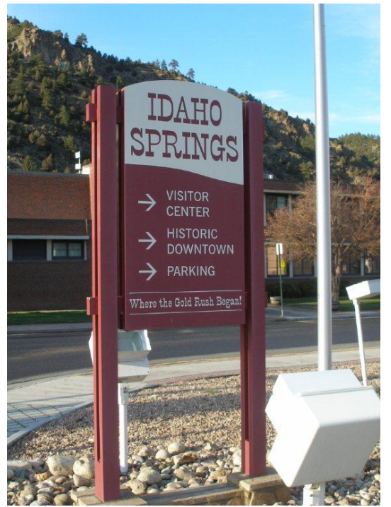
Miner Street Signage