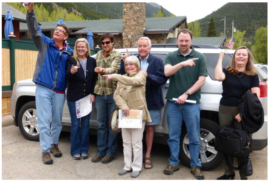
Joint Guanella Pass and Mount Evans Wayfinding Assessment Teams