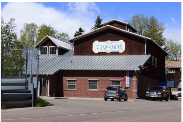
Idaho Springs Visitor Center/Heritage Center