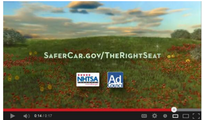
Child Passenger Safety - Oz Click Away :15

The Ad Council has recently distributed the new Oz CPS public service announcements (PSAs). Links to view the TV spots on Ad Council's YouTube Page are below. In addition to TV, we also released radio, web banners and outdoor PSAs in both English and Spanish. In addition to NHTSA and Ad Council, Warner Brothers also plans to promote the PSAs through their social media accounts. Feel free to share these videos on your organizations website and social media outlets.